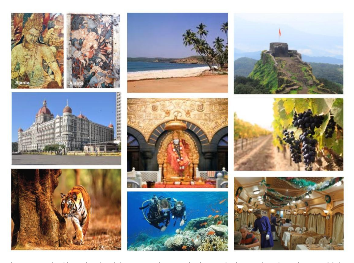
Figure 1 A snapshot on the tourism potential in Maharashtra

The state is also blessed withrich history, tradition and culture, which is evident through its world class ancient forts and monuments, ancient cave temples and pilgrimage centers. The state is the leader in the country with respect to foreign tourist arrivals (20.8%) into India and one of the leading states for domestic tourist visits (7.2%).